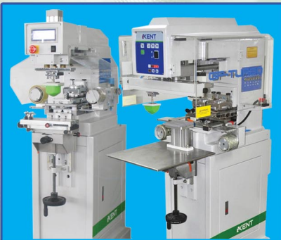
KENT pad printer