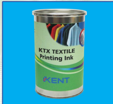
Special ink for textile