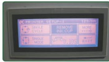
PLC control touch screen panel