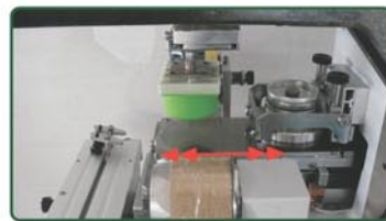
Platform in / out movement & pad clean underneath design for max. product size