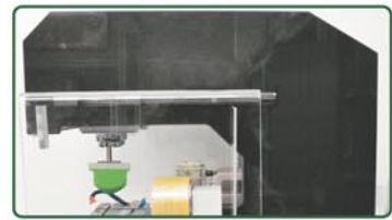
Stable granite stone machine structure