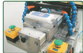
Product holding in/out shuttle