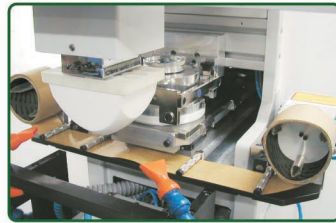
Auto pad clean