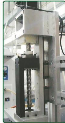
Servo motor driven pad stroke