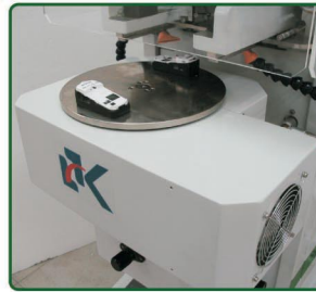
2-Station MOTOR Turntable