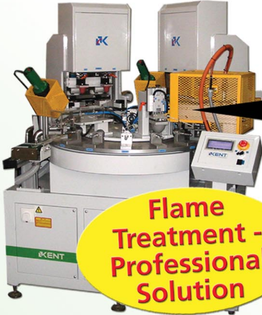
Flame Treatment - Professional Solution