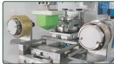
Auto pad clean