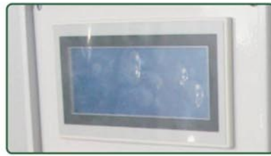
PLC control touch screen panel