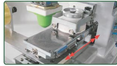
Platform in / out movement (Pad clean underneath)